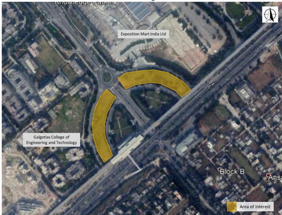
Figure 1: Satellite view of the Area of Interest