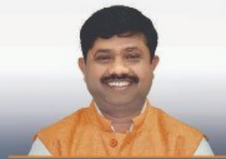
Nand Gopal Gupta 'Nandi' Minister of Industrial Development Uttar Pradesh