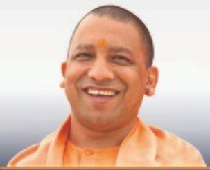
Yogi Adityanath Chief Minister, Uttar Pradesh