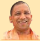
Yogi Adityanath Chief Minister Uttar Pradesh